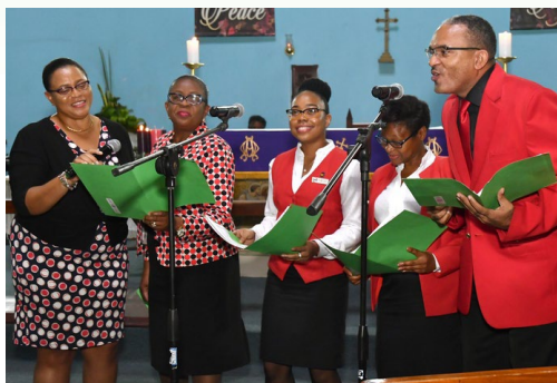
FHC Choir comprising of our team members showcasing their vocal range as they performed at the 2nd staging of our Carol Service.